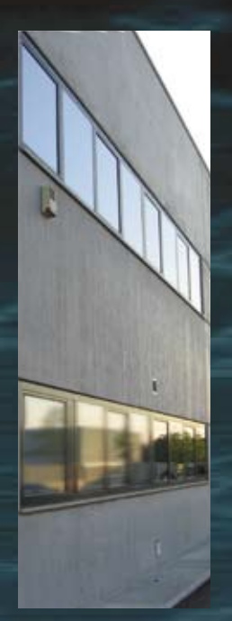
SMALL AND MEDIUM COMPANIES

THE IDEAL SOLUTION FOR ANY TYPE OF BUILDING