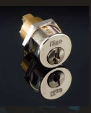
CSF is the highest security for the whole cylinder range.

The result is an easy, but absolutely secure, management of all staff movements.